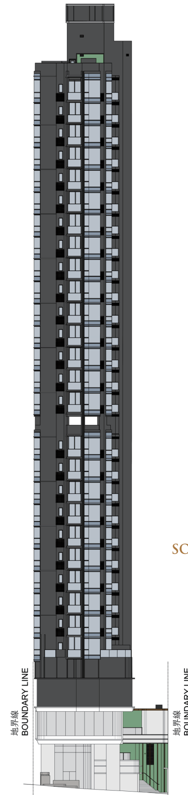
東南立面圖 SOUTHEAST ELEVATION